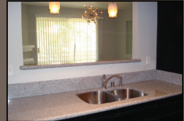
Granite Countertops Throughout