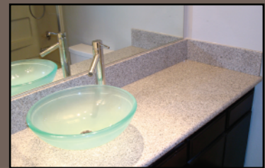
Vessel Sinks in Both Bathrooms

2811 W. Ave K-12 | Lancaster | CA | 93536